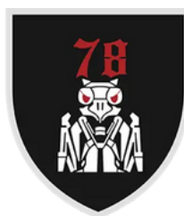
78th Special Purpose Regiment 'Hertz'