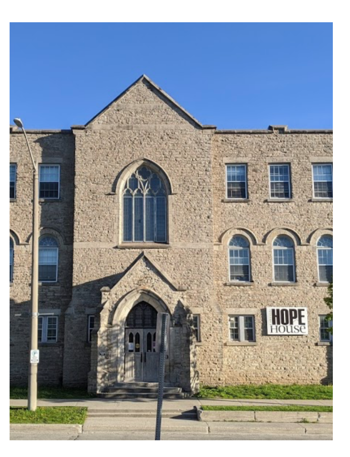
10 Cork Street, Guelph

With 18,000 square feet of usable space, HOPE House is a significant care centre in the Guelph community.