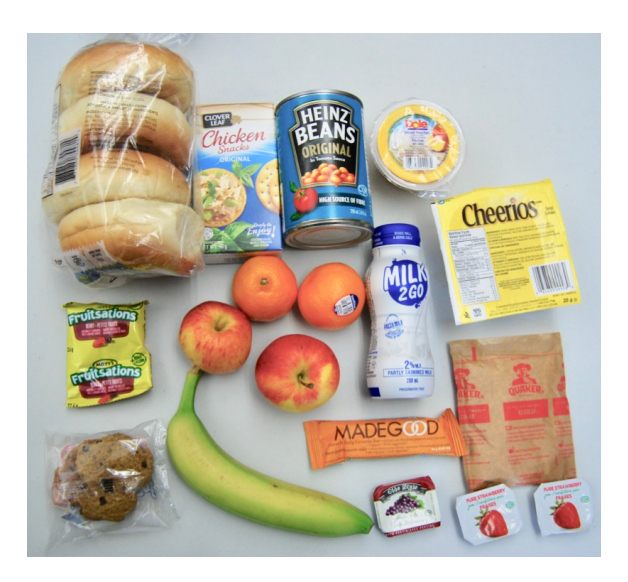
Protein, Grain, Dairy, Fruit & Veg, Snacks

Food bags each weekend delivered through schools