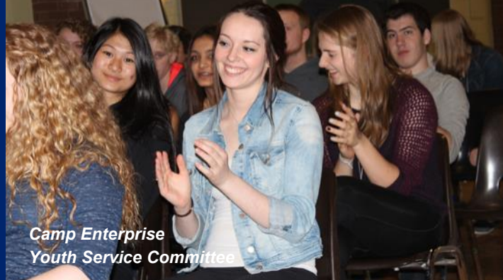
Camp Enterprise Youth Service Committee

We were the first club in KW to support the inclusion of women in Rotary, established the first Women's Probus Club in KW and founded the Rotary African Women's Education Fund. We have supported multiple local charities and institutions over the years and have developed or supported several international humanitarian projects. We are the lead club in the Community Development Care Centres project in KwaZulu, Natal, South Africa, which to date has created over 50 Child Care Centres for Aids orphans. Our club has been the recipient of many RI Presidential Citations and we have had four club members serve as District Governor.