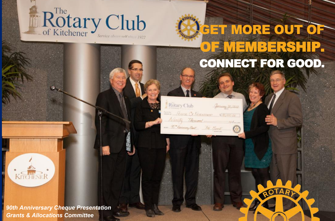
90th Anniversary Cheque Presentation Grants & Allocations Committee

"THE GREATEST OF ALL ACHIEVEMENTS ... ARE THE RESULT OF THE COMBINED EFFORT OF HEART AND HEAD AND HAND WORKING IN PERFECT COORDINATION."