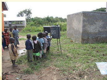
Barlonyo Nurs- ery School Hand washing Instruction