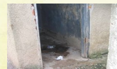
Boys' Latrine at Aloi Secondary School