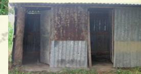
Girls' Latrine at Aloi Secondary School

Make a Difference...give the gift of safe water and sanitation that we tend to take for granted everyday!