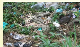
Current Waste Management System