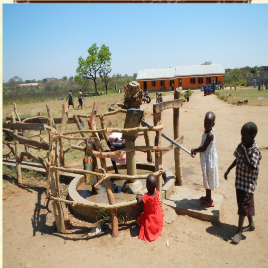
Barlonyo Vocational and Nursery School Well— built in 2010 and currently serving 400 community members daily