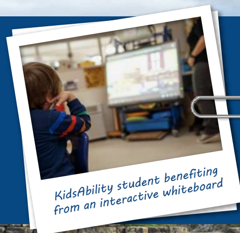
KidsAbility student benefiting from an interactive whiteboard

To help make brighter futures possible, click here and donate today!