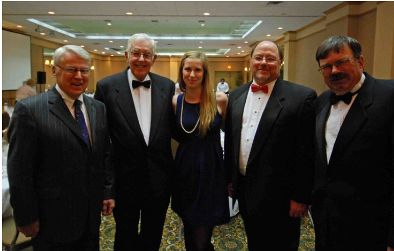
Members of the Board at our Annual Foundation Dinner in 2011