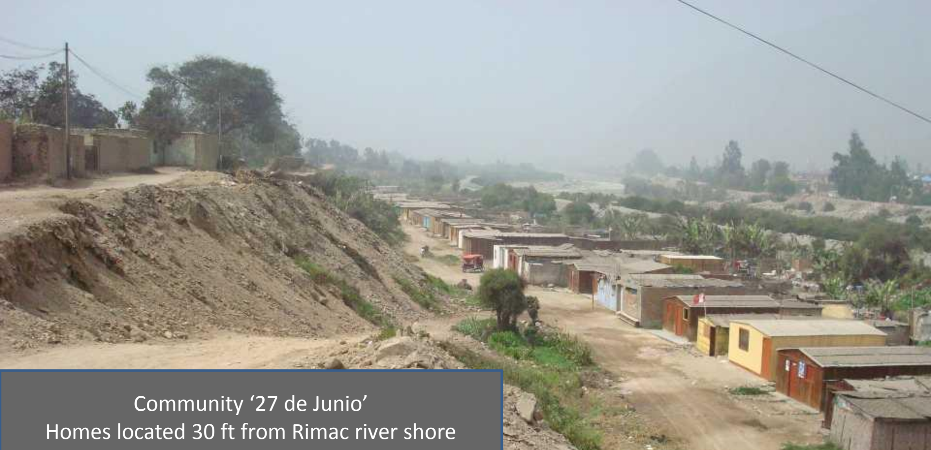
Community '27 de Junio' Homes located 30 ft from Rimac river shore