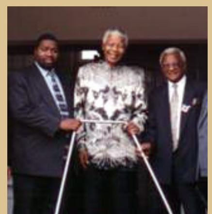
A personal message from former South African President NELSON MANDELA...

4 An established connection could bear additional fruit such as personal friendships, teaching opportunities, pen pals, etc.