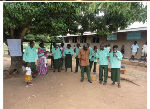
Community Sensitization through Drama—TASO Mbale Branch