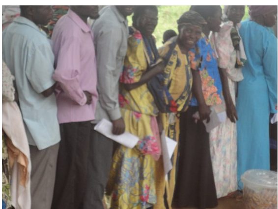
Rotarians at work at the registration Desk