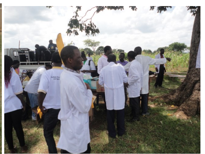
Getting ready for the medical tasks , trainings & transfer of the skills