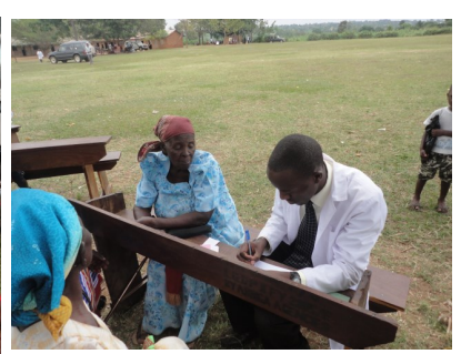
One on one specifications!

Rotarian's Classifications had to temporarily Change because of the required services!