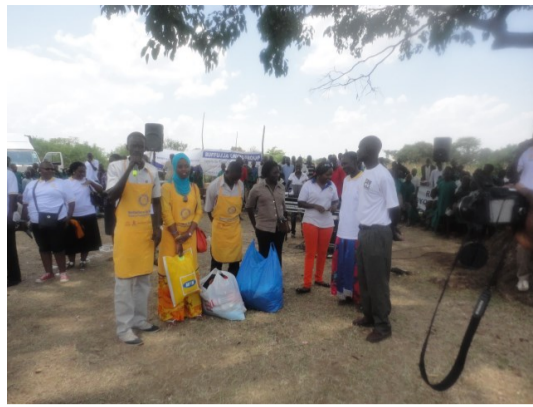
UIU Rotractors donating Used & New clothes to the Community Groups