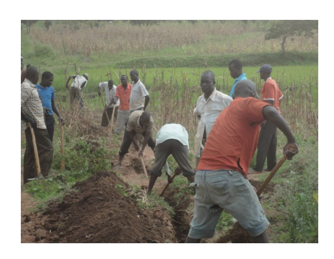
Clearing the Clogged up areas along the line