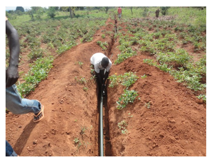
Water piping the entire 6 Km length