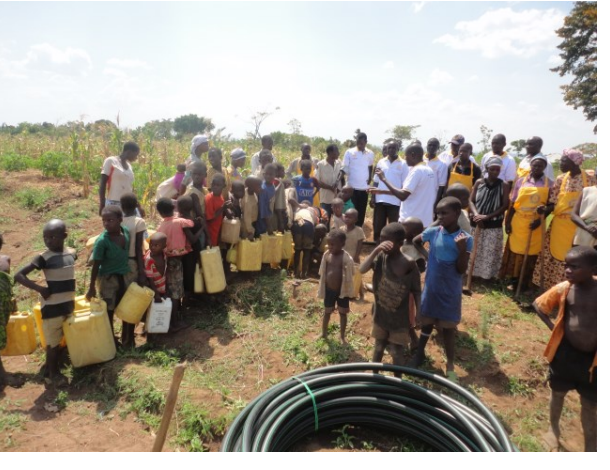
Tests were made for every Kilometre covered for the pressure levels. Here locals were following the Water Engineers to draw at least the test line water for that day, they were already seen with sire of new life and hope. This temporarily slowed down the piping as crowds were drawing the test water with a lot of hope and relief!