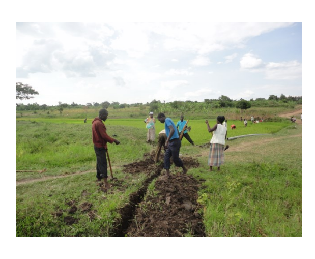
In certain areas, opening up the clogged areas was another challenge that require extra protective efforts.