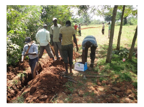
This was at the completion of the entire trenching of 6 Km. This was at the point of Water Connections to the NWSC main water supply line.