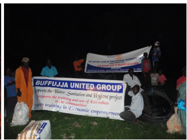
The trucks with the pipes arrival at Buffujja community after a 250Km run from the factory, where though at night received by the enthusiastic crowd who spent the rest of the night guarding the pipes with a lot of excitement!