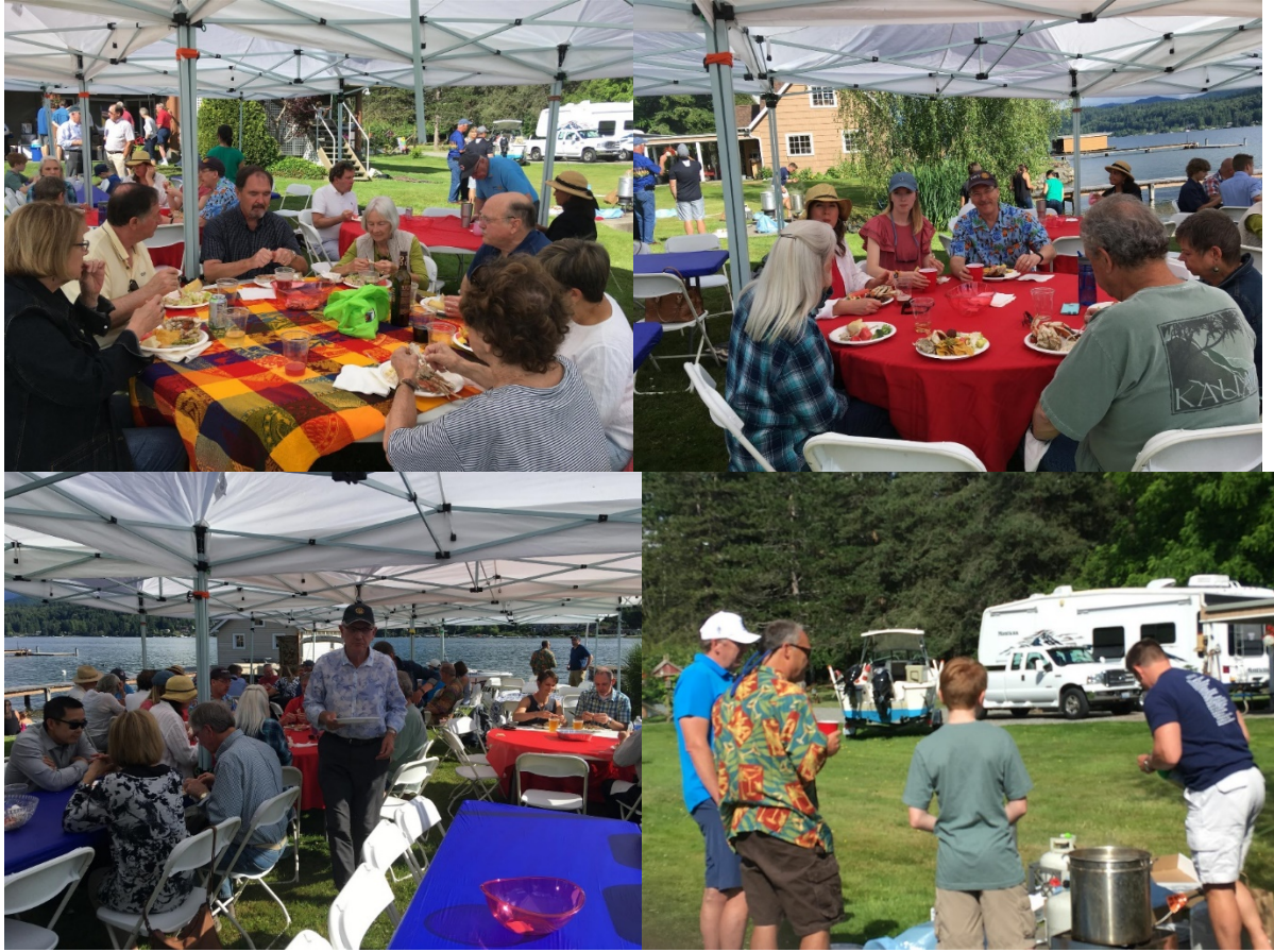
Held our annual Brewers by the Bay, July 2018