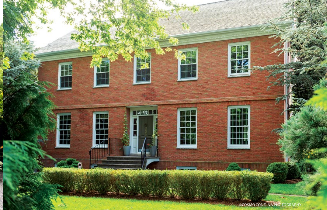
DECORATOR: THE VILLAGE FLOWER WILLOW CAKES MAGICAL PASTRY ARTS DISPLAY