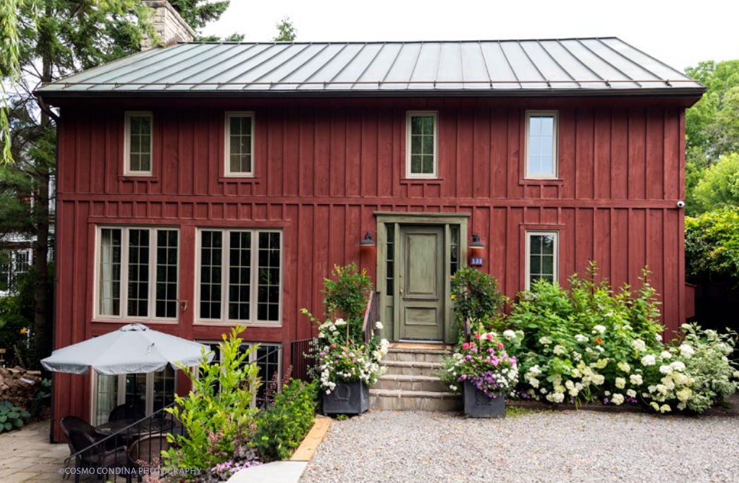
DECORATOR: VAN NOORT FLOWER STUDIO, JUNE FLORAL & GARDEN, & JULIE BALLARD