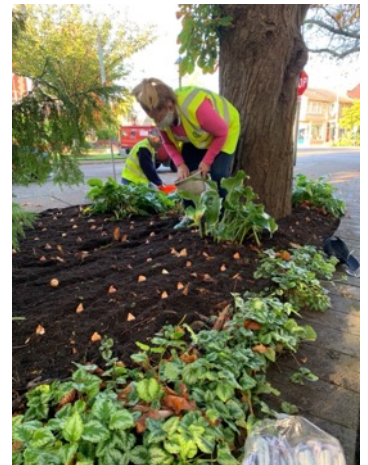
PLANTING TULIPS FOR POLIO