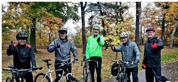
BIKE FOR POLIO