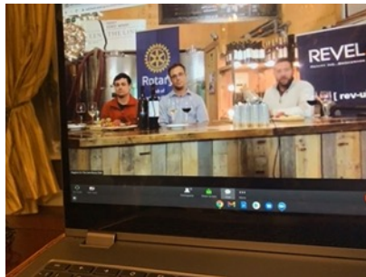
VIRTUAL TASTING TOUR