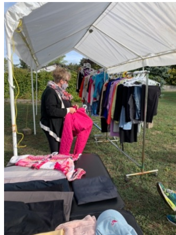
ROTARY ESTATE SALE: A HUGE SUCCESS