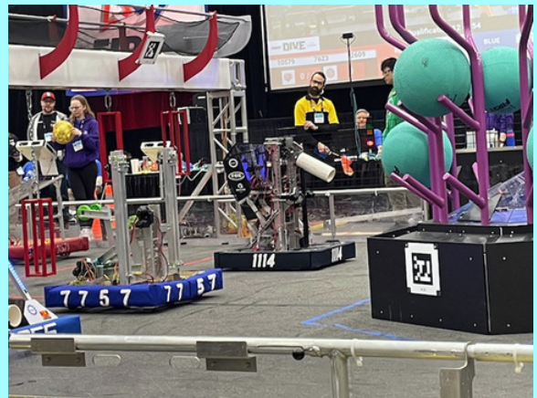
Robot 1114 enters field of play.