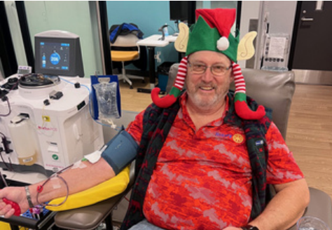
Who is this little elf?