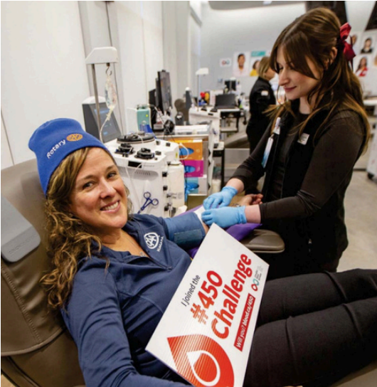
Look who's on the front page of the Standard.