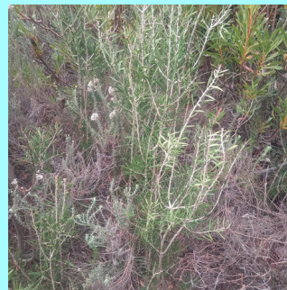
Bottle brush before.

For more information, go to https://sugarbird.org.za/ .