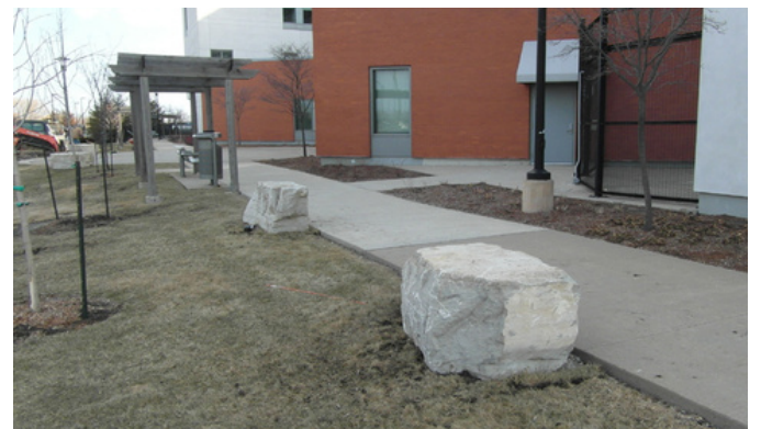
Two Sitting Rocks on the South entrance..