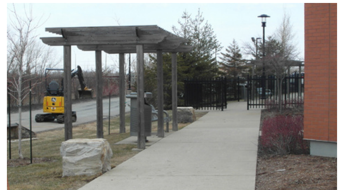
Two Sitting Rocks on the North entrance..