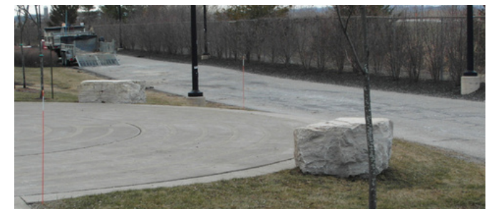
Two Sitting Rocks on either side of the circular Labyrinth..