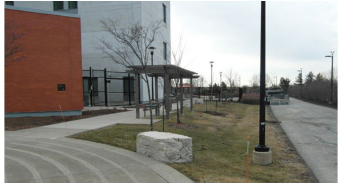
Sitting Rock in position..