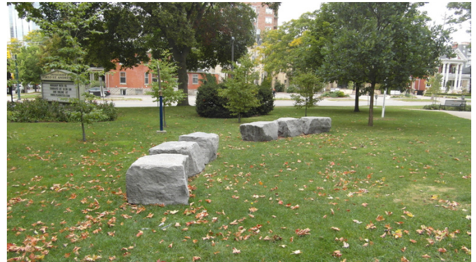
Example Sitting Rock installation from London garden.

The rocks will be offered at a sponsorship level of $1500 per rock when we launch our Phase 2 fundraising campaign next month.