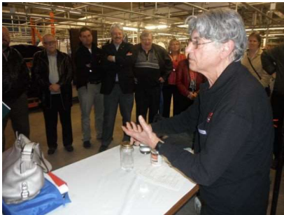
Touring Manor Cleaners 2011.