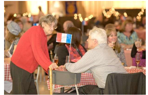
Discussing the issue of the day, Evening in Paris April 2014.