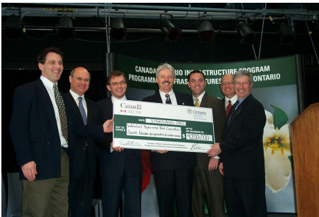
Accepting support for Charles Ansell Park from Waterfront Trust.