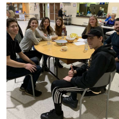
Another outstanding job by our Student volunteers.