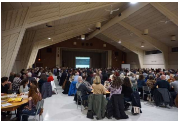
The hall is packed! watchful