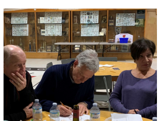
Al obviously knows the answer!