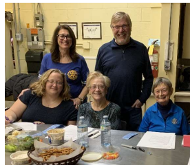
The marking crew ready to go.