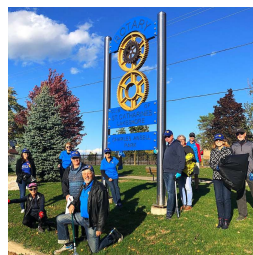
Socially distanced "litter pickers".