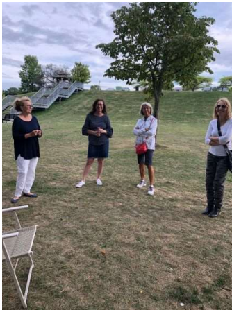
Members chat at a social distance.