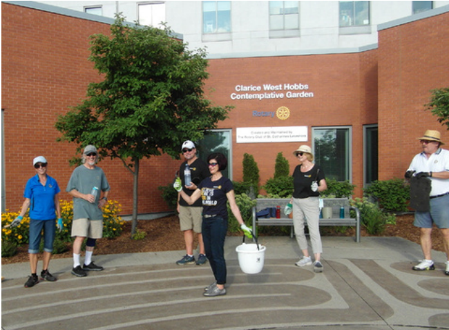
Part of the Team – ready to go!