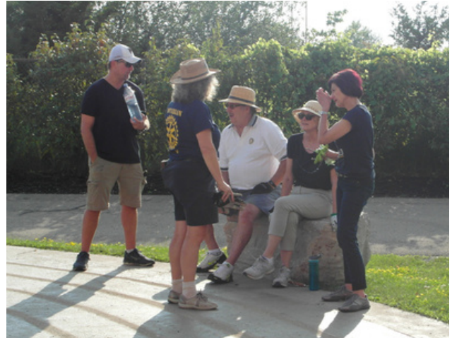
Taking advantage of a Sitting Rock.