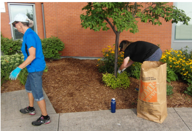
Hard at it!