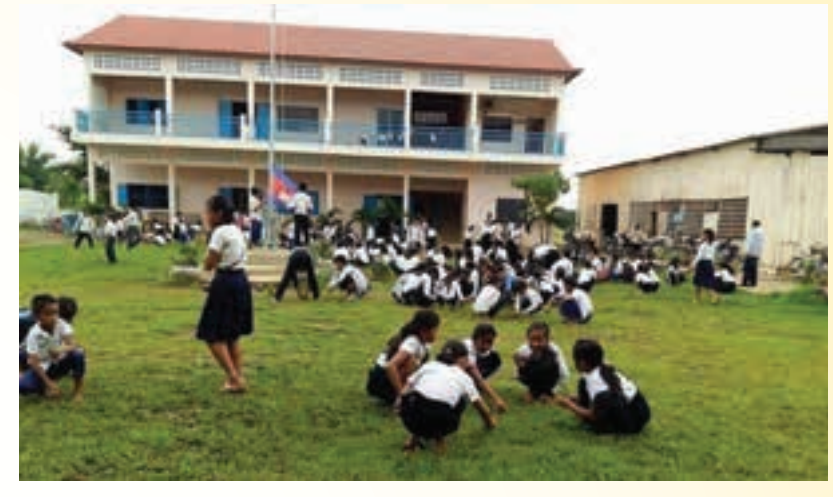
A new grass playground donated by the Rotary Club graces the front of The Cambodia Academy. A safe, clean place for the students to enjoy.