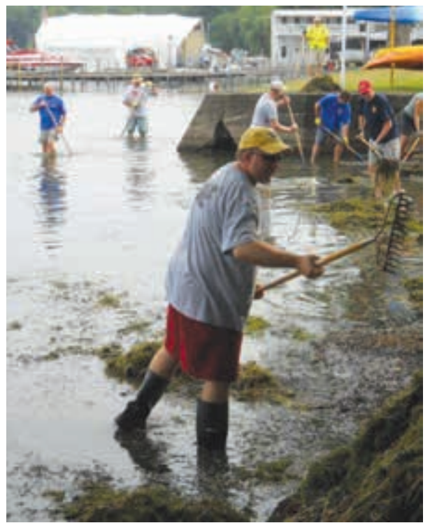
Rotarians and friends cleaning the Chautauqua Lake shoreline.