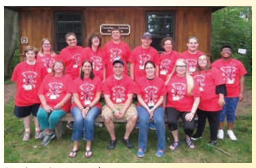
Handicap Camp Attendees