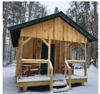
Rotary Cabin at Camp Southaven.