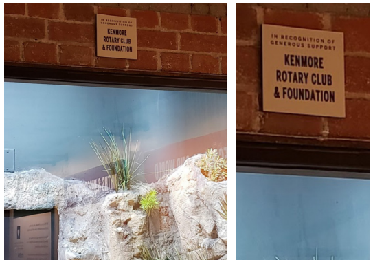
Our Club & Foundation sponsoring an exhibit at the Buffalo Zoo.