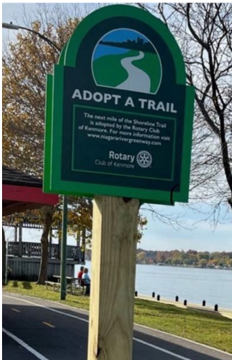
Rotary Club of Kenmore Adopt A Trail section along the Shoreline Trail.