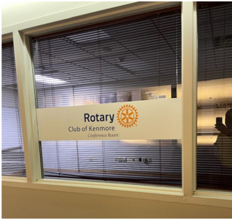
Rotary Club of Kenmore Conference Room at the Buffalo Museum of Science.

Over the last 100 years the Rotary Club of Kenmore has sponsored a variety of projects in our community.