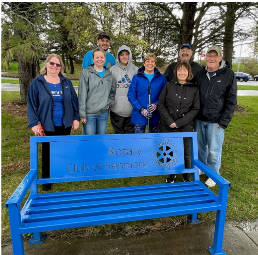
Rotary Bench located in Isle View Park in Tonawanda, NY.