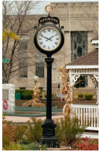
Rotary Clock located in the heart of the Village of Kenmore, NY.