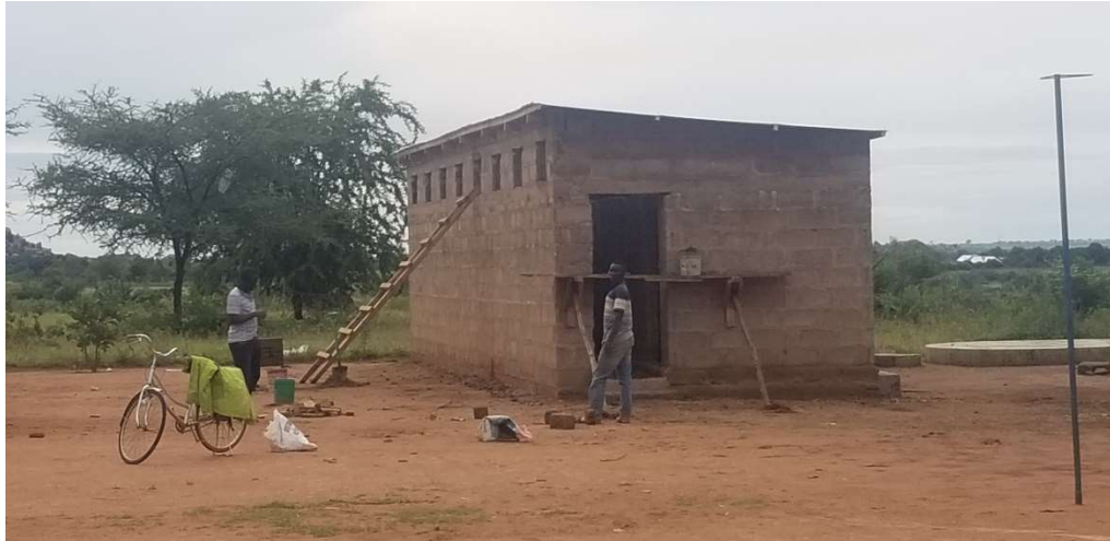
Here they are just finishing off the gables