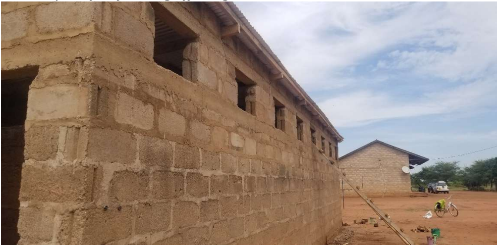
I was hoping for a steeper slope but we had some pretty heavy rains and all good.