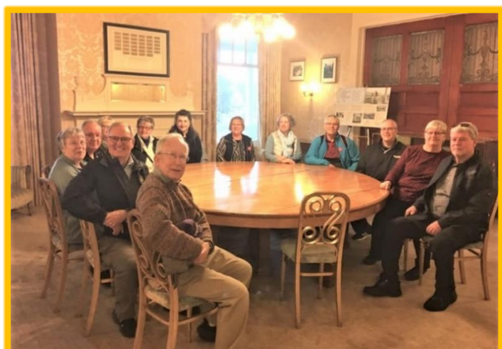
Proud Canadian Rotarians. Love the shirts! Are they singing "Oh Canada"? The group at the Bretton Woods Accord Room.

Fall colors popped as the Rotary Friendship Exchange with District 5360, Alberta, Canada, got underway October 5-8, 2019.