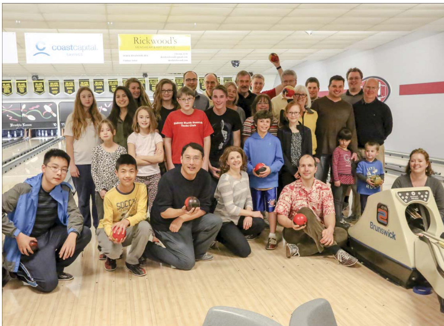
A fine looking group of Rotary bowlers gathered at Brechin Lanes on Friday, March 27th for an evening of fun, fellowship and pizza!

Club Meeting Friday at 12:00 p.m. at the Coast Bastion Inn