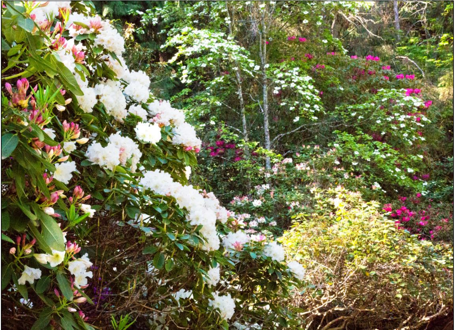
Rhododendrons are now blooming in Bowen Park