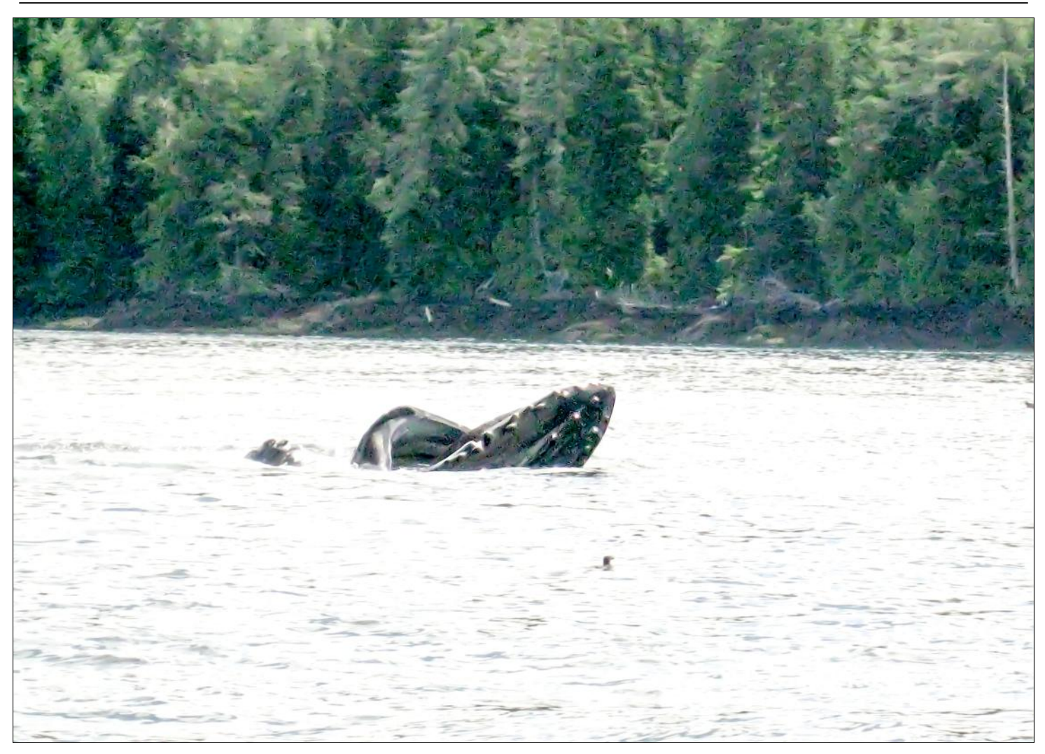
Humpback whale on its back feeding at Telegraph Cove