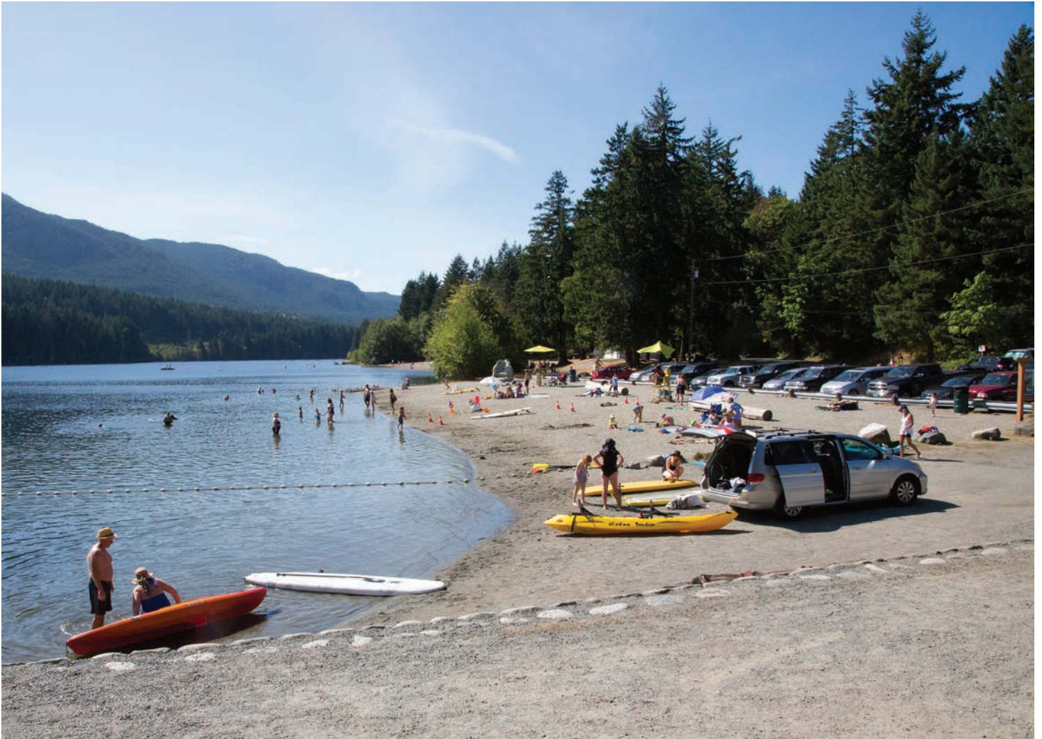
Families enjoying a Sunday at Westwood Lake, a jewel in Nanaimo