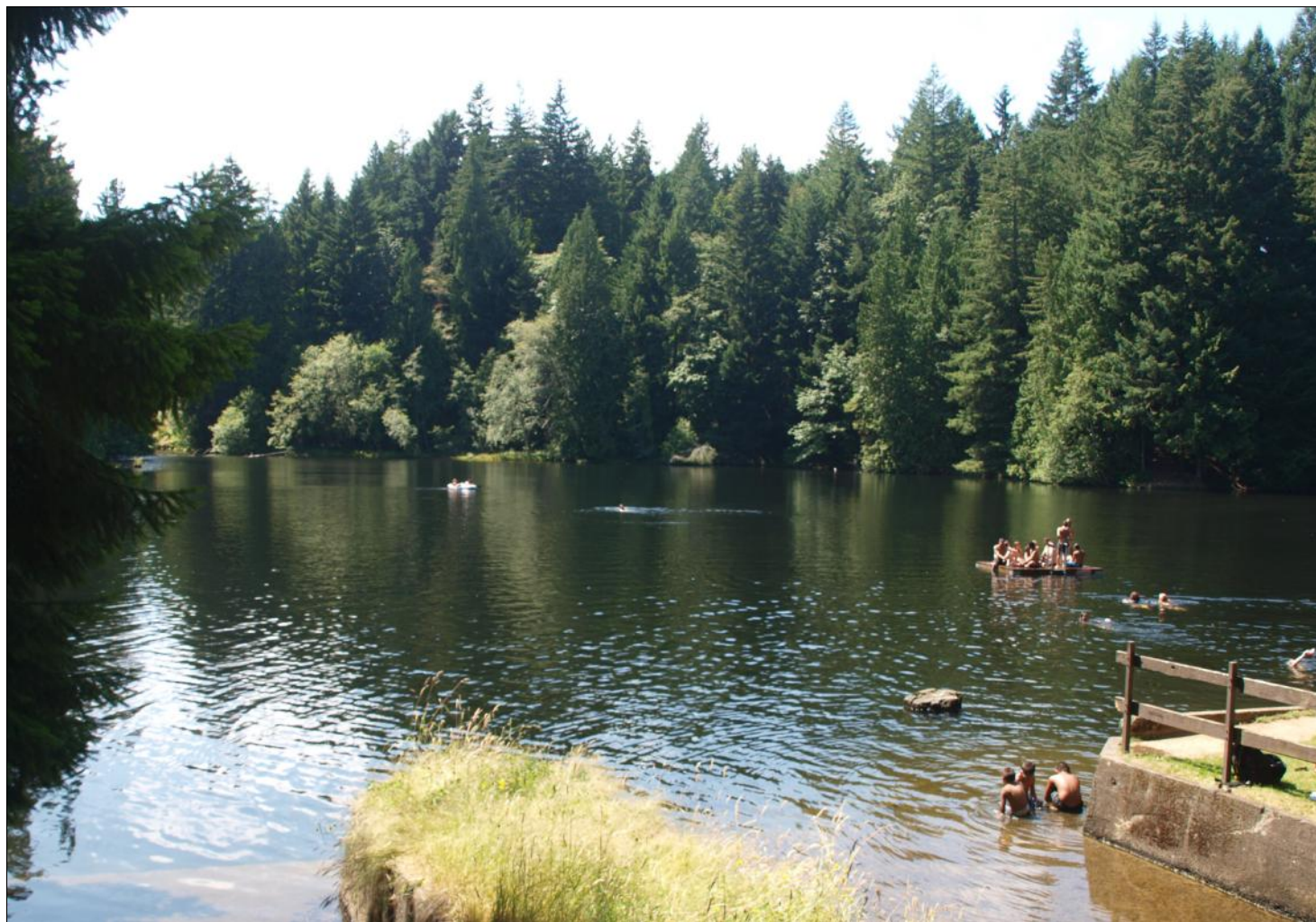
Citizens enjoying the cooling waters of Colliery Dam Park.

Club Meeting Friday at 12:00 p.m. at the Coast Bastion Inn