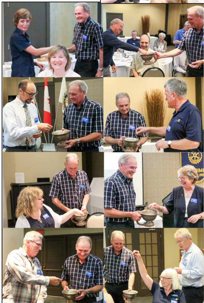
Rotarians happy to give for the good of Rotary