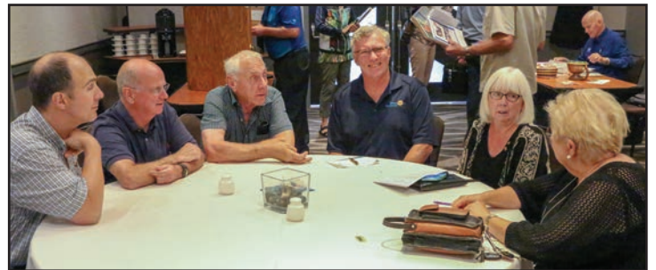
Community Service committee met after Rotary to discuss proposed projects.