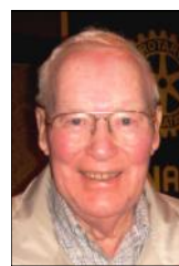
92 years young!