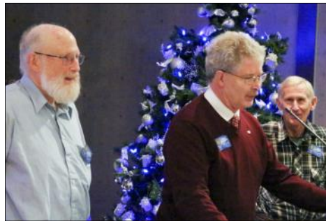
A face that hasn't been seen since 1973 will be unveiled next Friday!