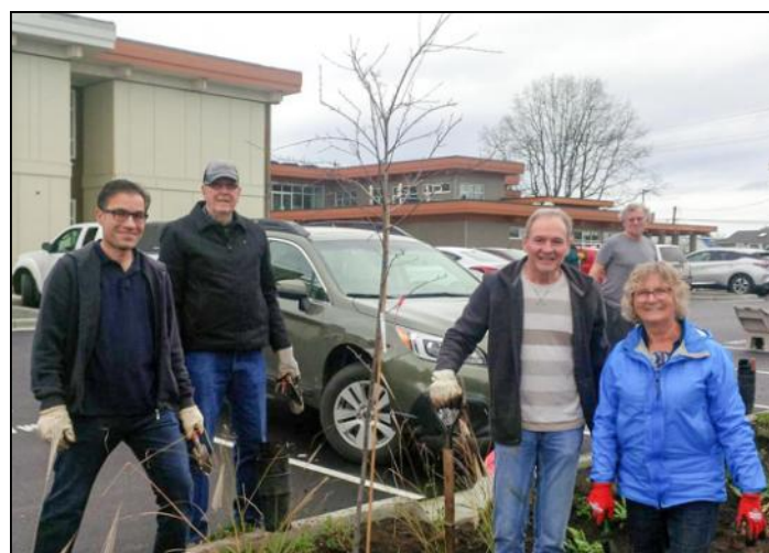
More of the Eden Gardens shrub planters