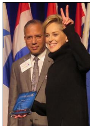
Actress Sharon Stone gives peace sign at conference.