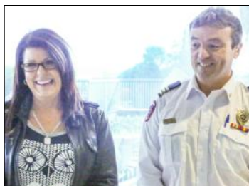
Other members of the fire department who came to our meeting and assisted with the AED demonstration.