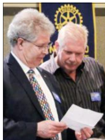
Another table is stumped by the Sgt-at-Arms' 1986 quiz questions.

of the essence to meet the Foundation's timelines. The motion is expected to be brought to the club on February 17 th .