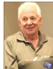
Salem—alive and well!