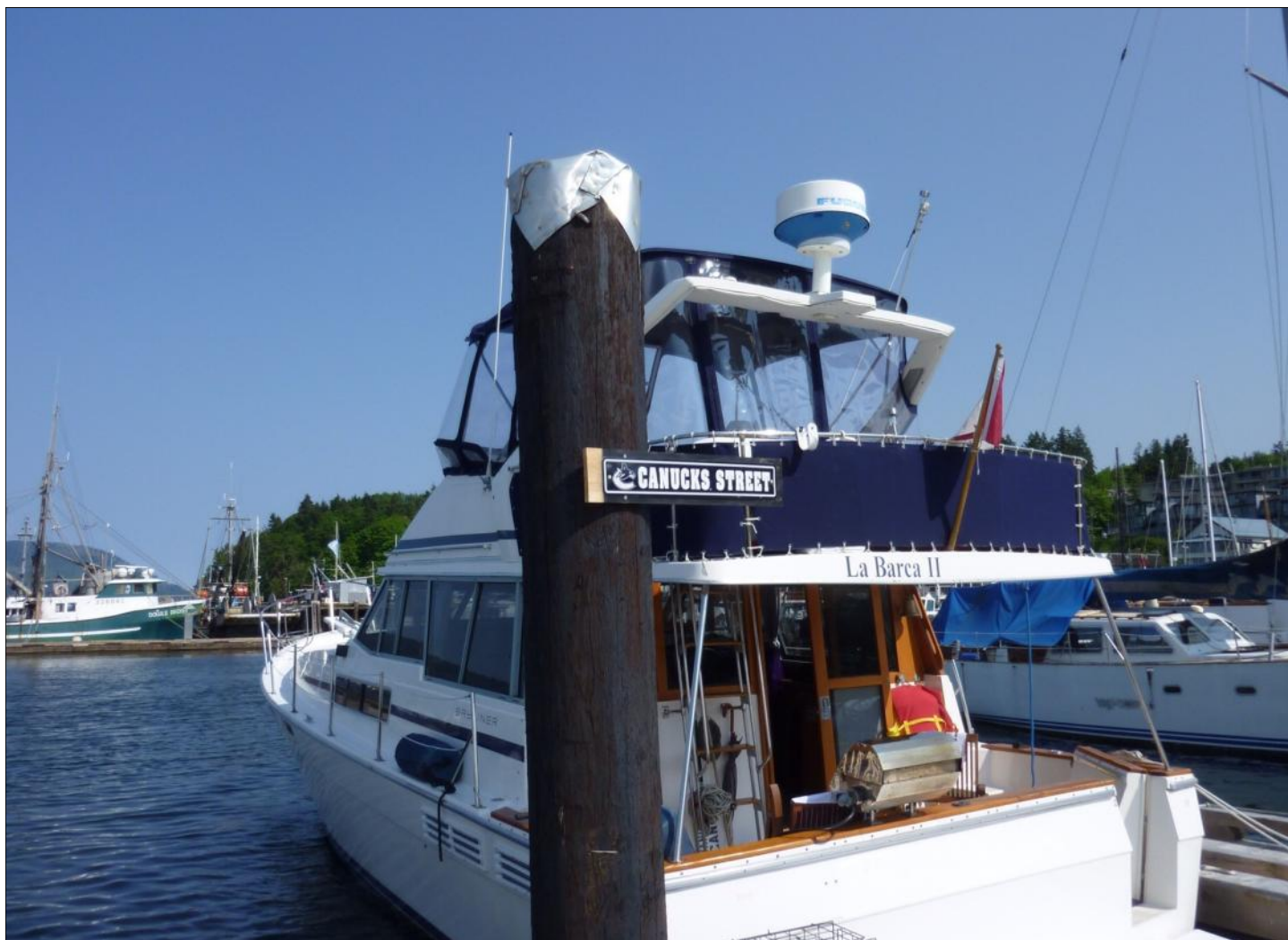
A Canucks fan at Cowichan Bay marina.

Club Meeting Friday at 12:00 p.m. at the Coast Bastion Inn