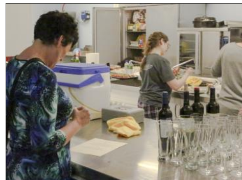
In addition to the ethnic food there was a selection of wines to choose from.