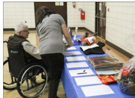
A silent auction capped off the evening of fine dining and fund-raising for the local members of the Rotaract Club.

ROTARY DISTRICT 5020 CONFERENCE—JUNE 19-21 Conference Centre, Nanaimo