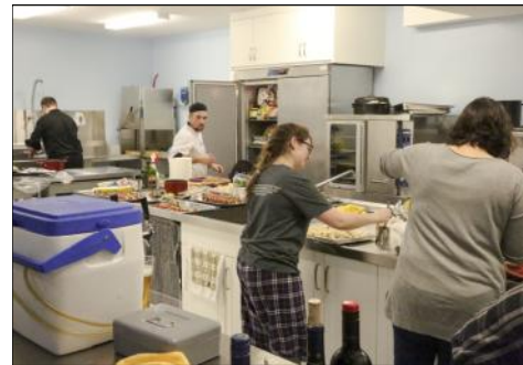
Rotaract members prepared a delicious dinner for visitors and guests.