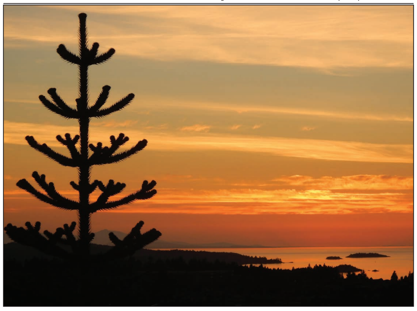
Great sunsets accompanying our great weather!

Club Meeting Friday at 12:00 p.m. at the Coast Bastion Inn CLUB OFFICERS 2017-2018