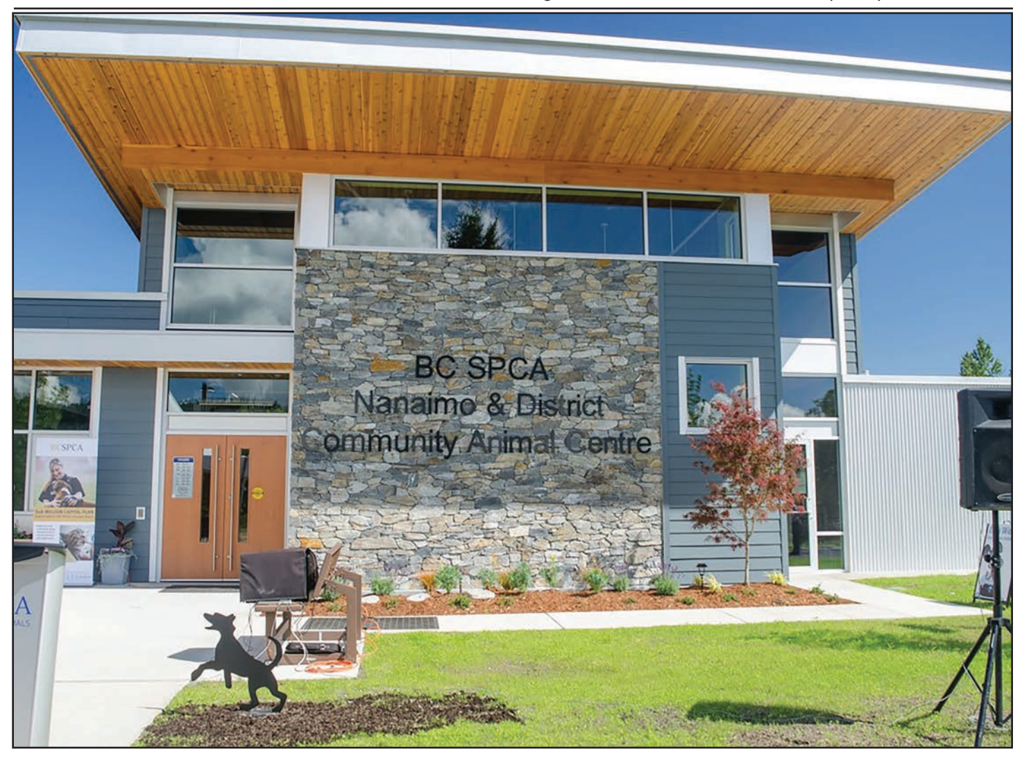
The New SPCA facilities in Nanaimo