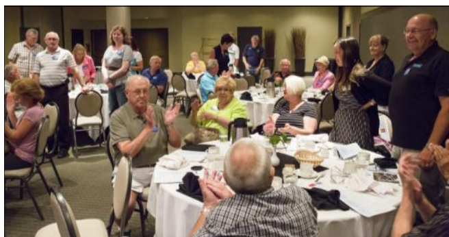
Summer Games volunteers were applauded for their efforts.