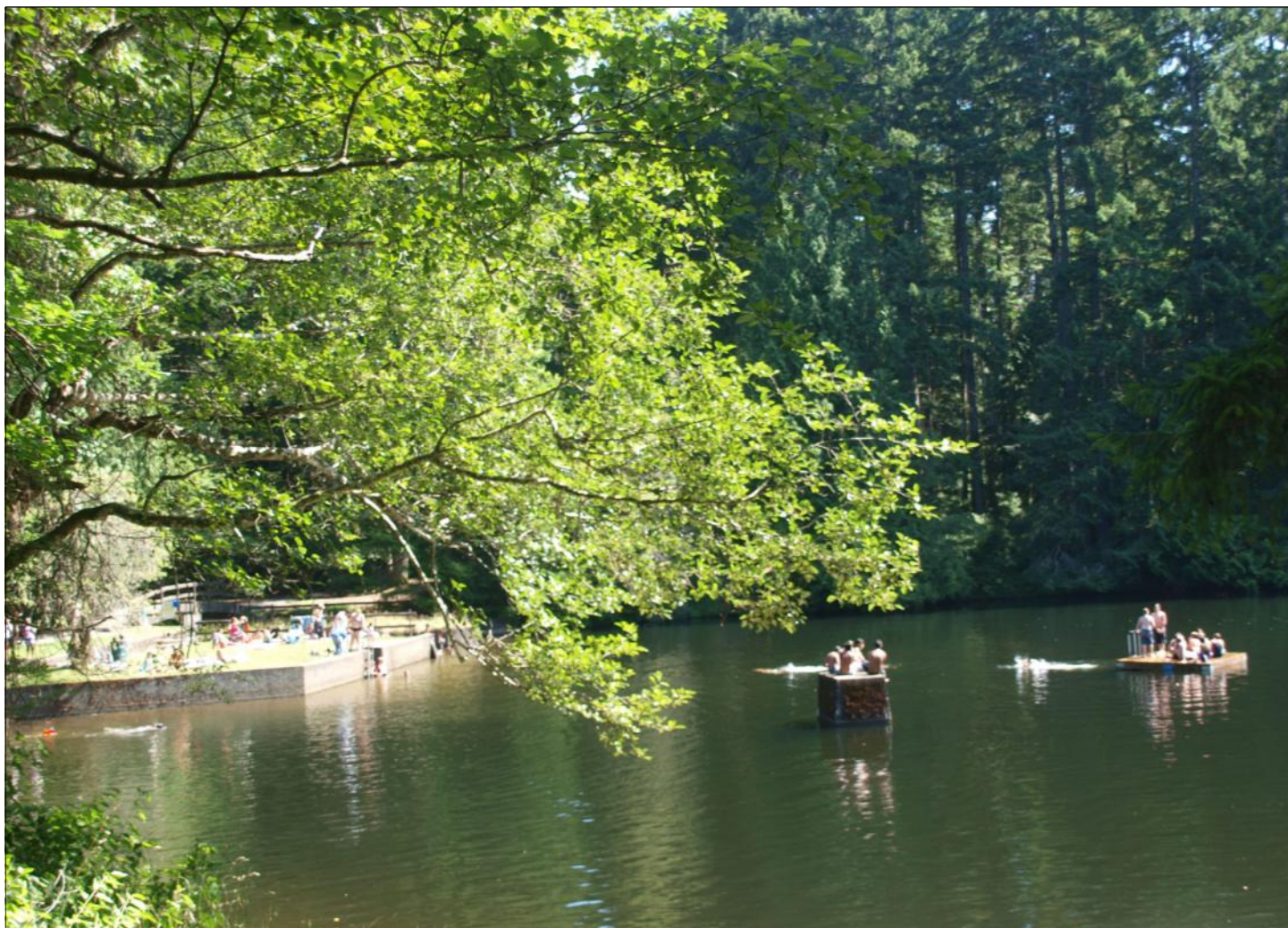
Colliery Dam Park in Nanaimo

Club Meeting Friday at 12:00 p.m. at the Coast Bastion Inn