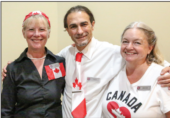
Staff at the Coast Bastion dressed for Canada Day.