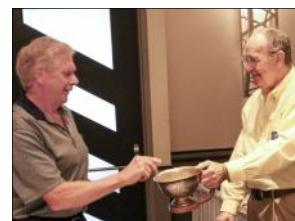
A number of "Happy Bucks" were paid last week.

sale and to announce the next book sale starts October 16 th .