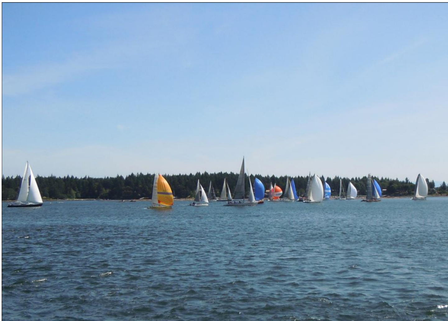
Start of the Van-Isle 360 as 52 yachts leave the harbour in downtown Nanaimo.

Club Meeting Friday at 12:00 p.m. at the Coast Bastion Inn