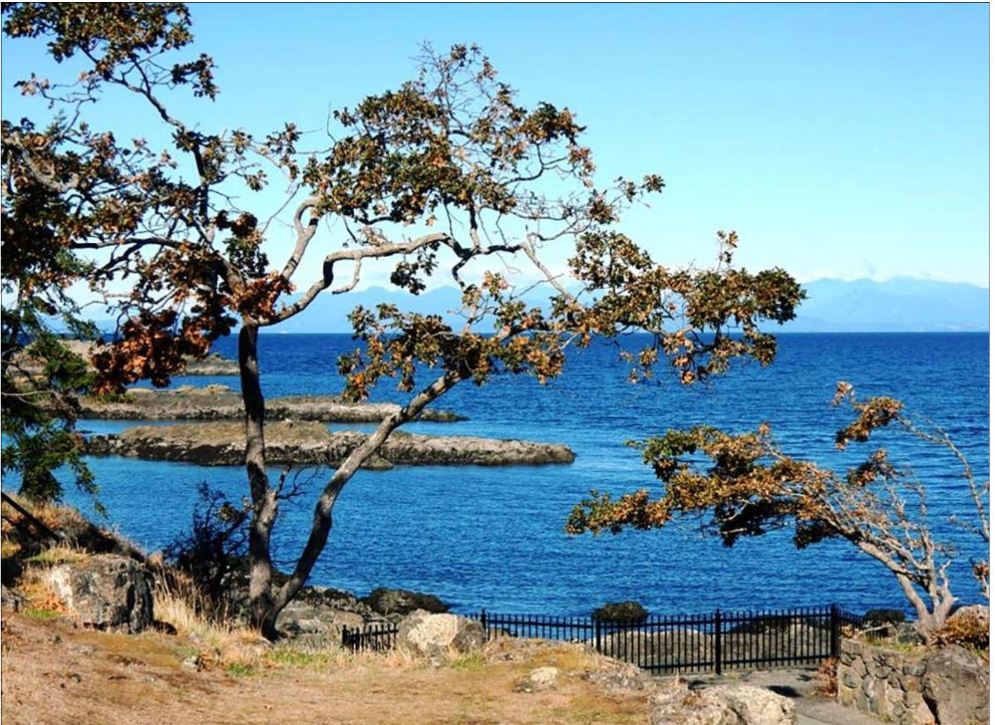
Neck Point

Club Meeting Friday at 12:00 p.m. at the Coast Bastion Inn