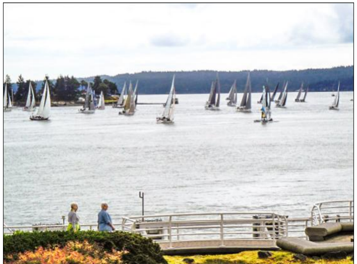
Start of the Van-Isle 360 Sailboat Race around Vancouver Island left Nanaimo Harbour on Saturday morning.